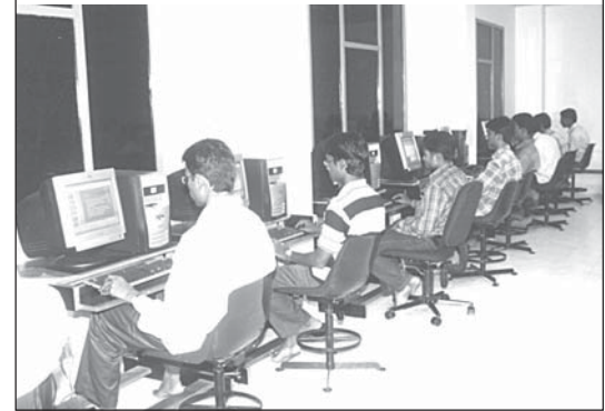
MBA students on Computers

The Nagarjuna Education Society, the sponsors of the College of Engineering, is always 'student-friendly' and aims at maximizing value addition to the student in all the academic policies it pursues from time to time. As a part of its student-friendly philosophy, a City Centre in Guntur town is set up by the college management with a reference library and a full fledged computer center with Internet facility for those students and Faculty who want to work beyond the college hours and to keep abreast of the world in a rapidly changing environment.