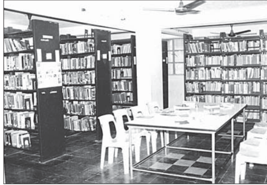
Our Journal Section in the Library