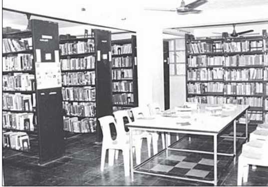
Our Journal Section in the Library