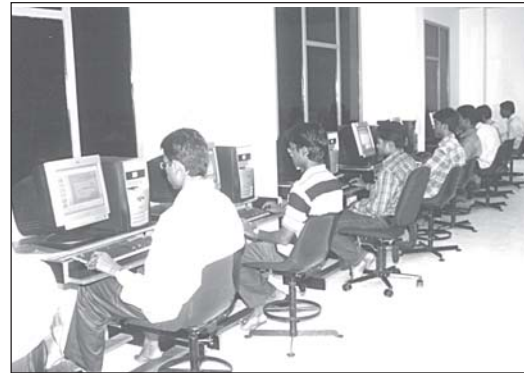
MBA students on Computers

The Nagarjuna Education Society, the sponsors of the College of Engineering, is always 'student-friendly' and aims at maximizing value addition to the student in all the academic policies it pursues from time to time. As a part of its student-friendly philosophy, a City Centre in Guntur town is set up by the college management with a reference library and a full fledged computer center with Internet facility for those students and Faculty who want to work beyond the college hours and to keep abreast of the world in a rapidly changing environment.