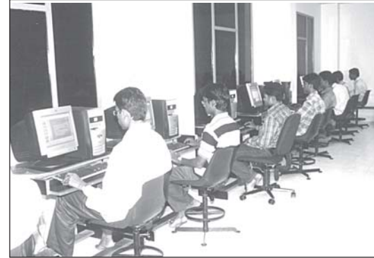
MBA students on Computers

The Nagarjuna Education Society, the sponsors of the College of Engineering, is always 'student-friendly' and aims at maximizing value addition to the student in all the academic policies it pursues from time to time. As a part of its student-friendly philosophy, a City Centre in Guntur town is set up by the college management with a reference library and a full fledged computer center with Internet facility for those students and Faculty who want to work beyond the college hours and to keep abreast of the world in a rapidly changing environment.