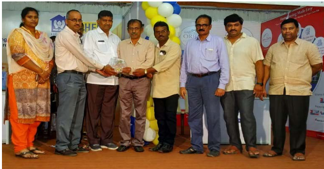
NAREDCO Property Builders Association presenting a Memento to the HOD and Staff of the Department of Management Sciences at Valedictory Function of NAREDCO Property Show - 2018