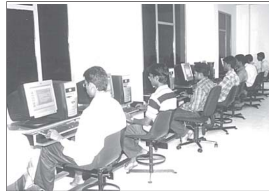
MBA students on Computers

The Nagarjuna Education Society, the sponsors of the College of Engineering, is always 'student-friendly' and aims at maximizing value addition to the student in all the academic policies it pursues from time to time. As a part of its student-friendly philosophy, a City Centre in Guntur town is set up by the college management with a reference library and a full fledged computer center with Internet facility for those students and Faculty who want to work beyond the college hours and to keep abreast of the world in a rapidly changing environment.